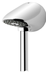
AQUAJET-Slimline shower head