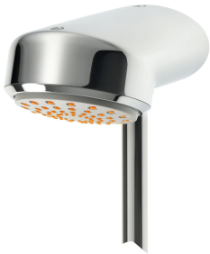
AQUAJET-Comfort shower head