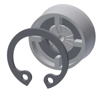
Flow controller 6.0 l/min