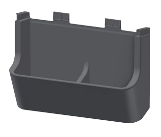
Shower gel dish for F5 shower panels made of stainless steel