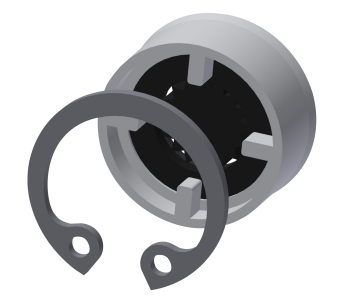
Flow controller 12.0 I/min