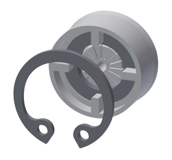
Flow controller 6.0 I/min