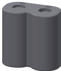
Lithium battery 6 V