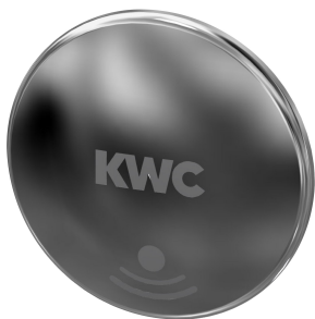
Cap for F3E