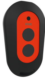
2-button remote control for fittings F3 and F5