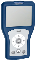
Bidirectional remote control for electronic fittings F3 and F5

Modell-Linie: F3E | F3EF3001 Flushing systems | Electronic urinal flushing systems