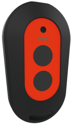
2-button remote control for fittings F3 and F5