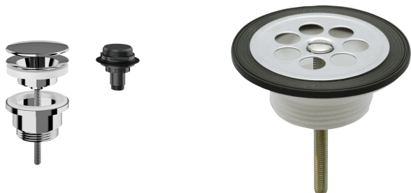
Dome waste valve, chrome-plated