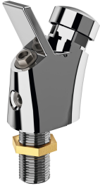
ANIMA drinking fountain tap

Modell-Linie: ANIMA | ANMX30U Drinking fountains | Drinking fountains