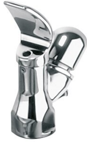
Self-closing drinking bubbler