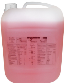
Liquid soap 2000057168 SO10L