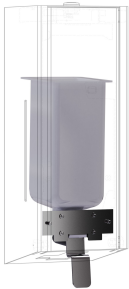
EXOS. conversion kit for liquid soap dispenser 2030022956 ZEXOS618K