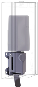
EXOS. conversion kit for foam soap dispenser