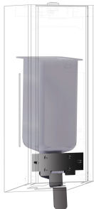
EXOS. conversion kit for liquid soap dispenser