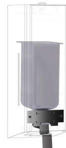
EXOS. conversion kit for liquid soap dispenser