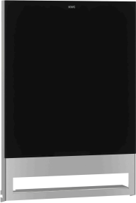
EXOS. front with black safety glass panel