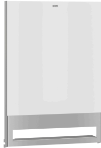
EXOS. front with white safety glass panel