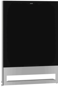
EXOS. front with black safety glass panel