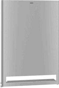
EXOS. stainless steel front for paper towel dispenser