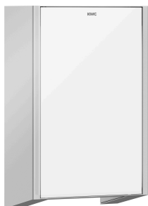
EXOS. front cover with white safety glass panel