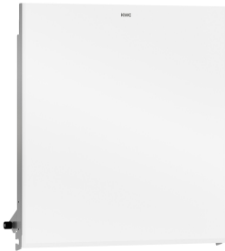
EXOS. front with white safety glass panel

Modell-Linie: EXOS | EXO602EB Accessories | Combinations