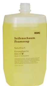
Foam soap cartridge