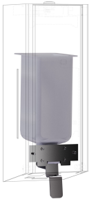
EXOS. conversion kit for liquid soap dispenser