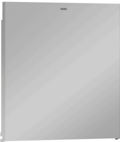
EXOS. stainless steel front for paper towel dispenser for recessed mounting 3600008927 ZEXO600E

Modell-Linie: EXOS | EXO602EW Accessories | Combinations