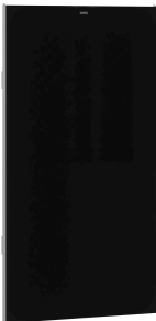
EXOS. front with black safety glass panel 2030022931 ZEXOS605B