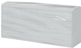
Paper towels 2030072378 FH70P