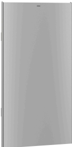
EXOS. stainless steel front for waste bin for wall and recessed mounting 3600008765 ZEXO605