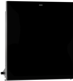
EXOS. front with black safety glass panel 2030034648 ZEXOS600EB