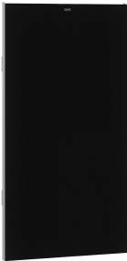
EXOS. front with black safety glass panel