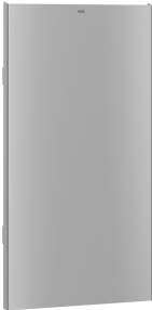
EXOS. stainless steel front for waste bin for wall and recessed mounting