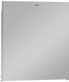
EXOS. stainless steel front for paper towel dispenser for recessed mounting