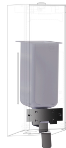
EXOS. conversion kit for liquid soap dispenser