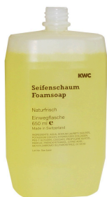
Foam soap cartridge