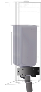
EXOS. conversion kit for liquid soap dispenser