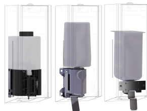
EXOS. conversion kit for EXOS. soap dispenser